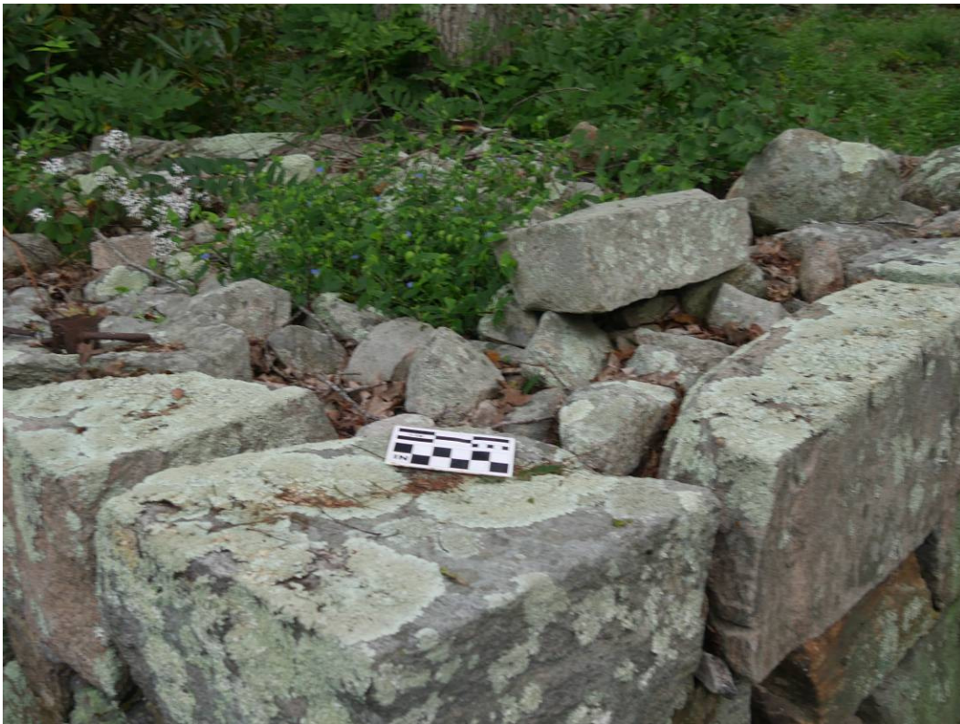
Stone interior fill