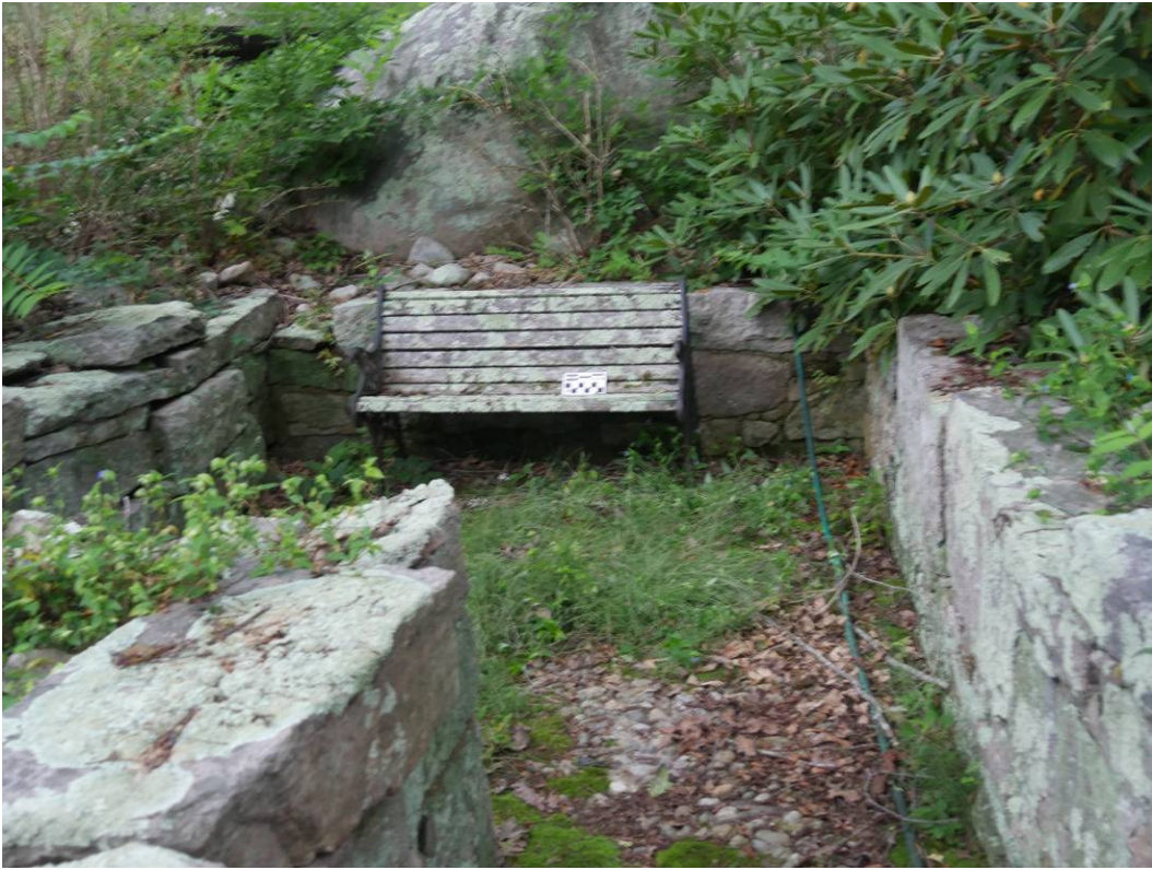
Interior of enclosure