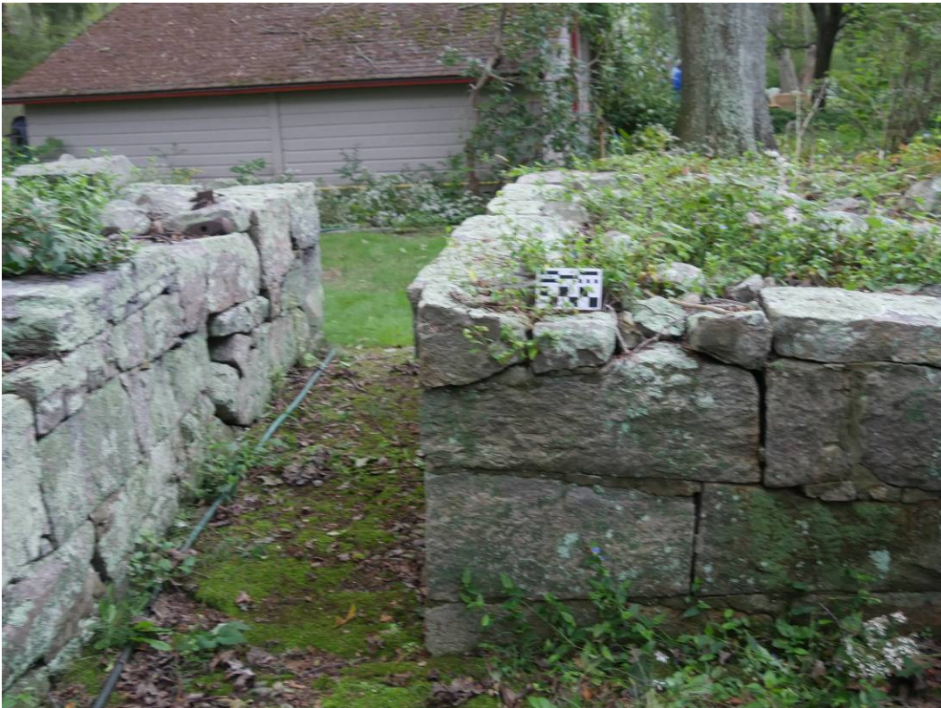
From inside looking out passageway