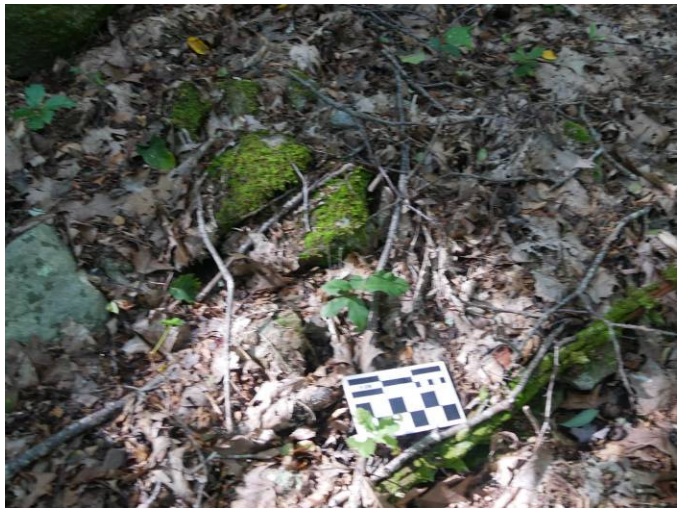
#5A Corner Wall Cairn on exterior of pasture wall (no photo)