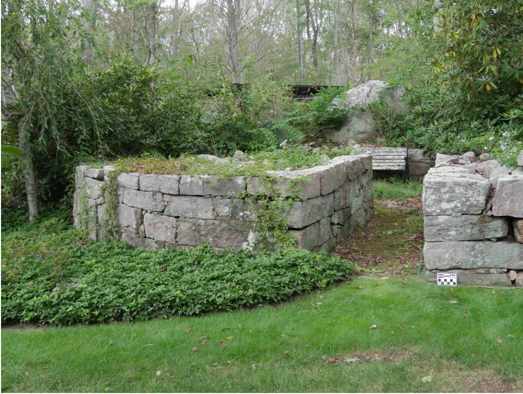
Left side curved front wall