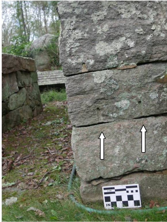
Quarry tool marks from plug and feather method