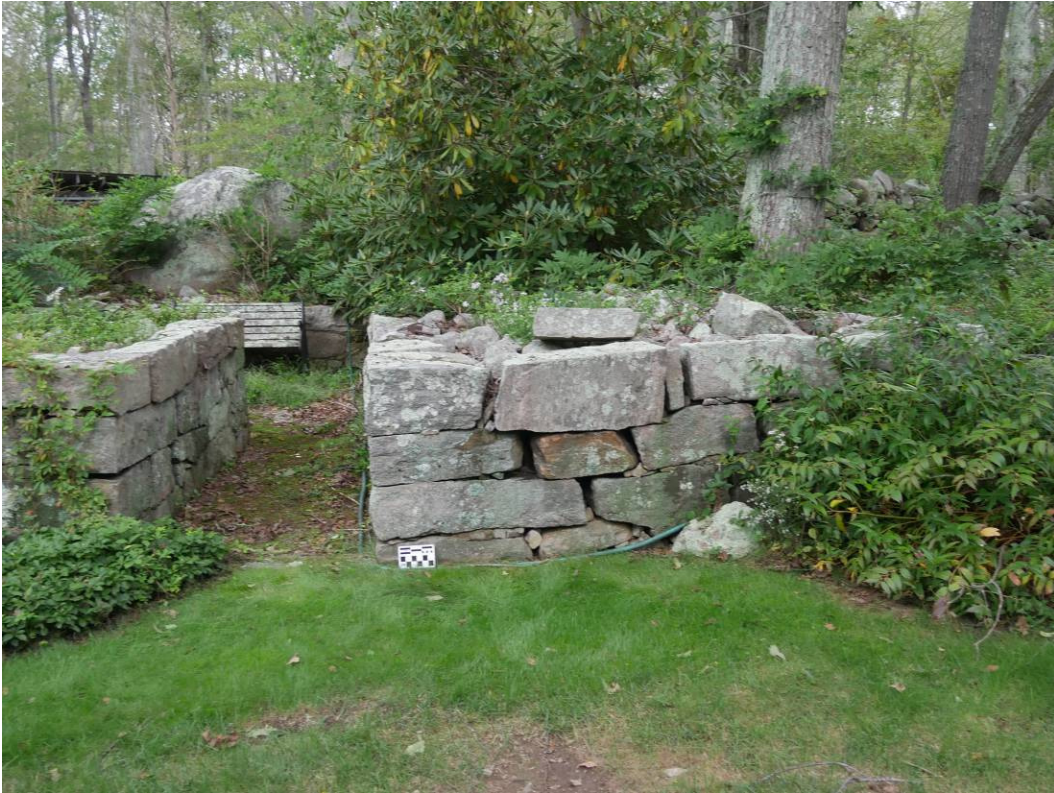
Right side with straight front wall