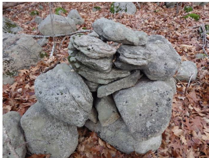
(B) Compact high partially stacked cairn on ground