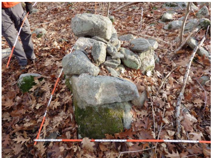
Possible Open End / Closed End design