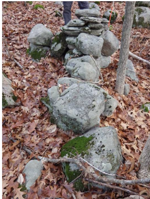
(A) Row of boulders