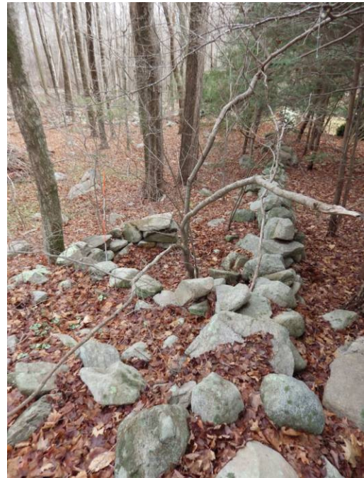
Mound between enclosure & road

The enclosure appears to have an older section and a rebuilt section. Note the lighter colored fresher looking stones on top of the back wall above the darker moss encrusted stones underneath. The darker moss encrusted stones are also seen in the old stone wall. This suggests there was an older abandon structure. The side wall has the lighter colored fresher looking stones suggesting it was totally rebuilt. The entrance has a flat stone on top with a stain suggesting a new addition. The entrance wall lacks the older darker stones underneath. Again, suggesting a rebuild.